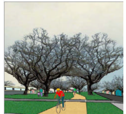
Vision of Lafitte Corridor with trail and parks

Produced by University of Missouri-Kansas City.