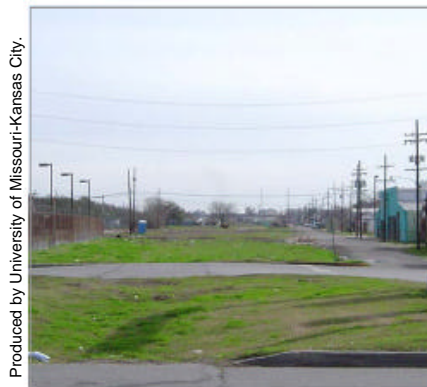
Lafitte Corridor today